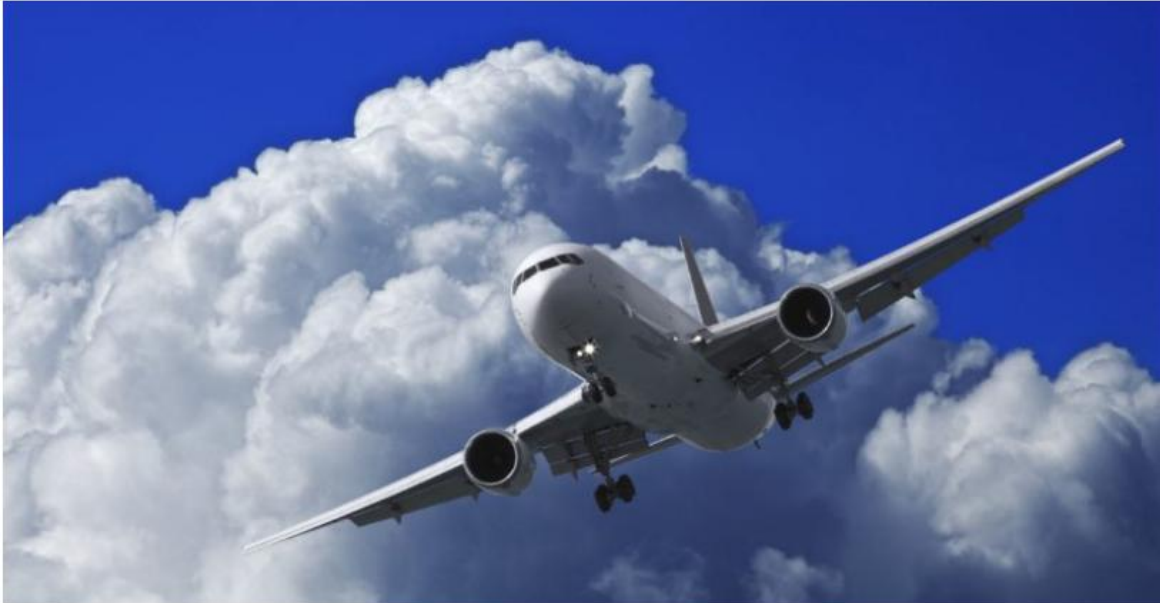
Passengers using hidden city ticketing are limited to carry-on luggage, as checked bags will end up at the final destination, and airlines typically cancel return flights for passengers who are no-shows.

Some airline customers have found deep discounts if their destination is a stopover, skipping the final leg of their trip.